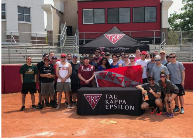
Had a great time at the Annual Alumni V. Undergrad Softball Game today. Thank you to everyone that came out to play! Alumni won 17-16.