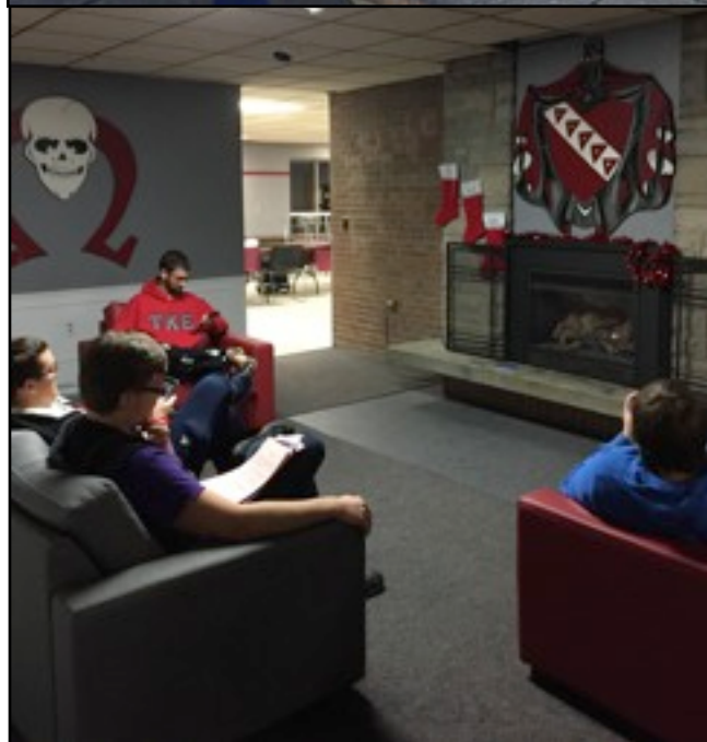
Top Photo: Prytanis Tech (front, left) and other Omega Fraters enjoyed the unseasonably warm autumn weather in front of the house. Bottom Photo: New sofas and chairs were purchased for the living room in time for Homecoming.