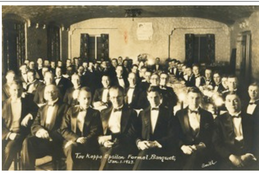
Tau Kappa Epsilon, Omega Chapter Installation Banquet, January 1, 1927

(800) 443-3050 or webersinn.com/reservations , group code TKA022517