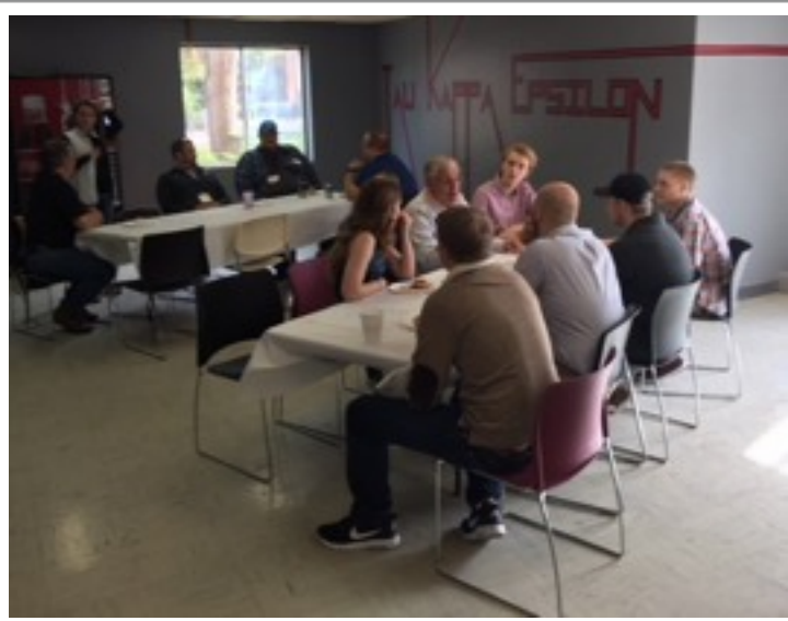
The annual Omega Chapter Homecoming Open House was well-attended by TKE alumni and friends of the fraternity. Visitors young and old enjoyed the display of old yearbooks and photos from the Omega Chapter archives.