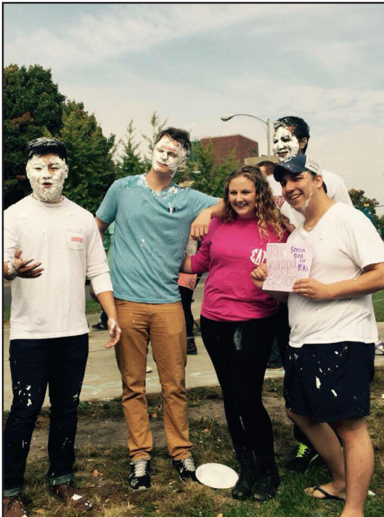
Fraters participating in Sigma Delta Tau's fundraiser.

It has been a very productive year at TKE Rho-Beta. Many of the fraters are very busy helping us expand our network and grow as a colony. We are doing great with volunteering in our local community and also in the Greek community. Since the start of the spring 2016 semester, we already have 220 volunteer hours as a chapter. We've participated in a few service opportunities thus far. We can't wait to get more involved as the semester rolls on, and into next semester.