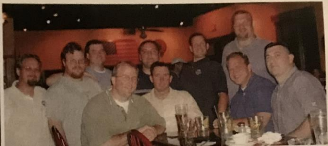
Teke Gatherings: GRIC at Hops↑, Nova at Hooters ↓.