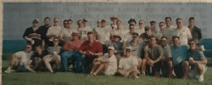
Fling 2000