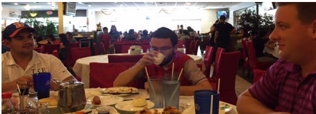
Enjoying Dim Sum at the Phoenix Palace on July 24th

WE WILL BE DOING A FOUNDERS DAY EVENT IN JANUARY 2017. MORE DETAILS TO COME .