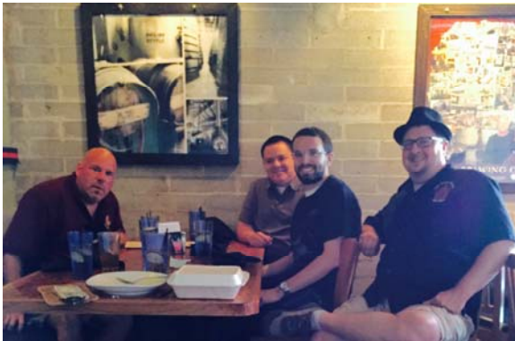
Sunday All You Can Eat BBQ Night at OHSO Brewery on July 10th

The month of July the alumni association hosted a number of dinners to give alumni an opportunity to meet and socialize. This Summer we enjoyed all you can eat BBQ at OHSO, Chicago style pizza at Lou Malnati's and my personal favorite of Dim Sum at the Phoenix Palace. If you missed your opportunity to join us we will be look at organizing a couple more events once the weather cools off in the Valley. All suggestions welcomed as to someplace unique and different for the next one.