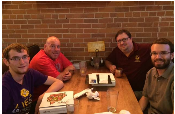
Enjoying a traditional Chicago deep dish pizza at Lou Malnati's on July 17th