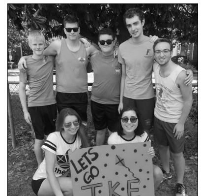
Tau Kappa Epsilon brothers pose with Kappa Alpha Theta sisters during their annual Capture the Kite philanthropy tournament on April 17, 2016.