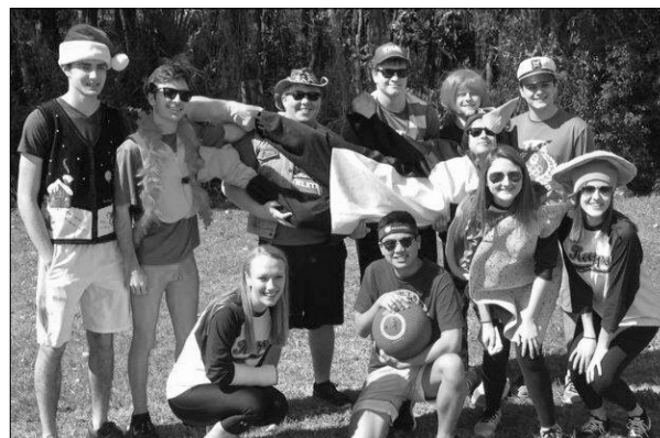
Gamma Theta brothers enjoyed competing in Kappa Kappa Gamma's annual Kappa Kickball Philanthropy on February 14, 2016.